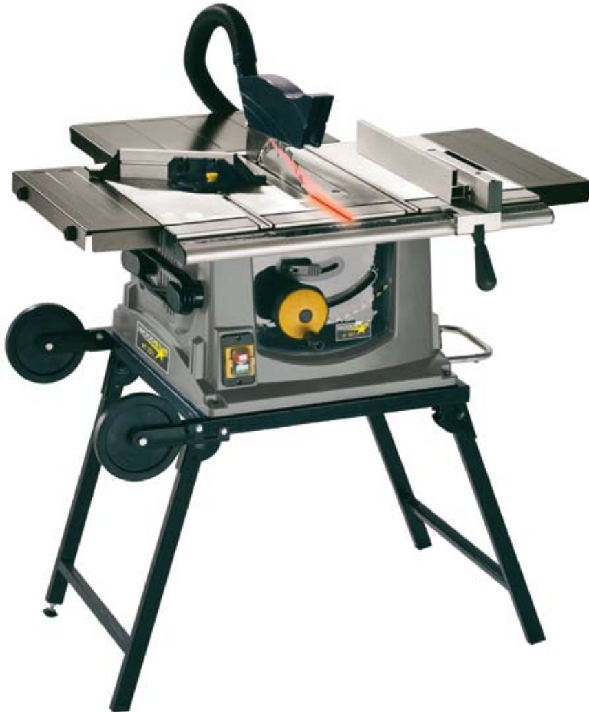
Table saw system st 10L

The machine in its basic form can be regarded as a bench top saw, which is light enough to be a portable unit and will quite easily fit into the boot of an average car. The leg stand clips to the machine and simply folds flat when not in use. Wheels are also provided to make movement easy.