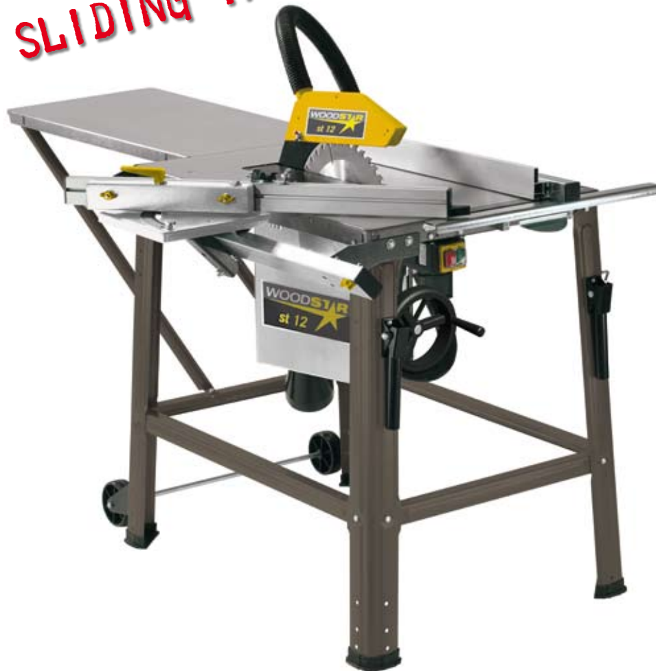
Table saw st 12

Ideal for sawing beams, boards, plates and wood-like materials in the workshop and at the construction sites. These sawbenches represent amazing value for money. Their generous specification fulfills the need for ripping, crosscutting, angle and compound angle cuts. Standard equipment includes: Sliding table carriage running on ball bearings, fence rail adjustable from 90° to 45°, wheel kit, handwheel - allows simple and precise setting of the saw blade, professional fence, table length extension (could be used also as table width extension).