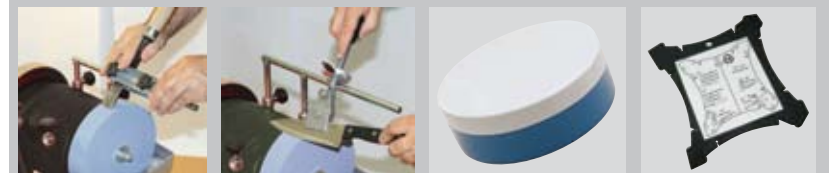
Jig for straight edge chisels, Jig for knives, Abrasion Paste, Angle Master